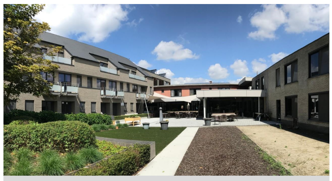
Nursing and care home 'Vlietoever' - Bornem