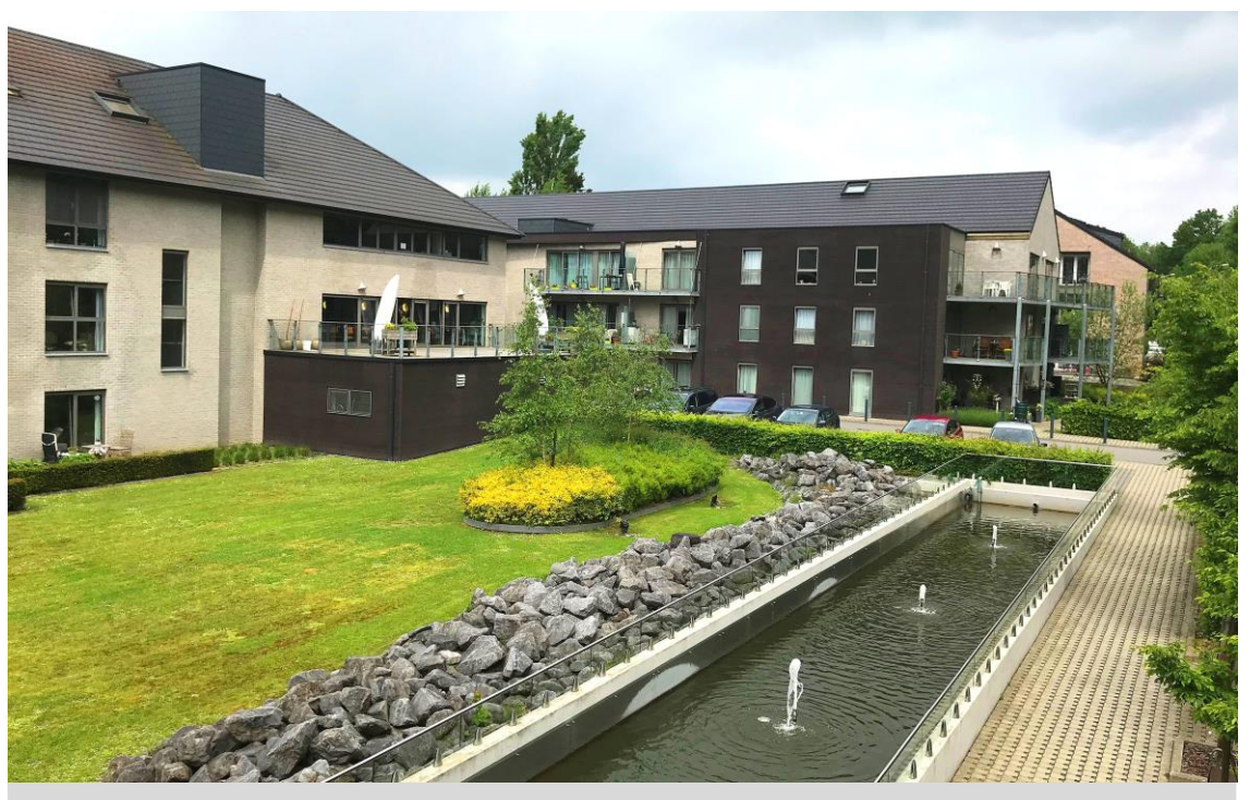
Nursing and care home 'Doux repos' – Neupré